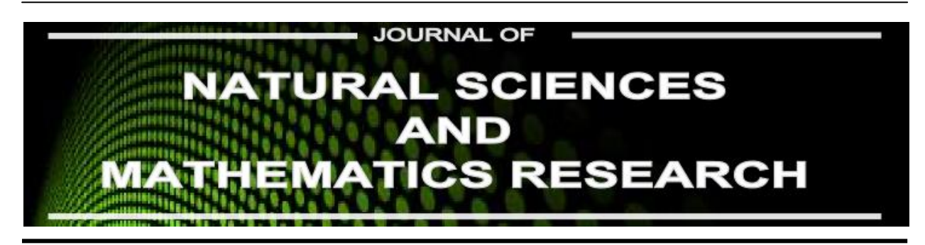
Available online at http://journal.walisongo.ac.id/index.php/jnsmr