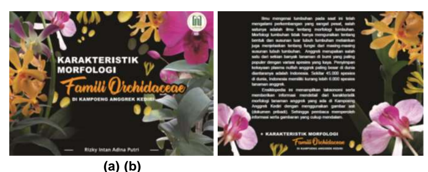
Figure 2. (a) Front cover page of the encyclopedia book, (b) Back cover page of the encyclopedia book

Bookencyclopedialt consists of 37 pages printed using A4 sized Art Paper (21 cm x 29.7 cm) based on ISO standards. The following is a picture of the front cover, back cover, and contents page of the encyclopedia book.