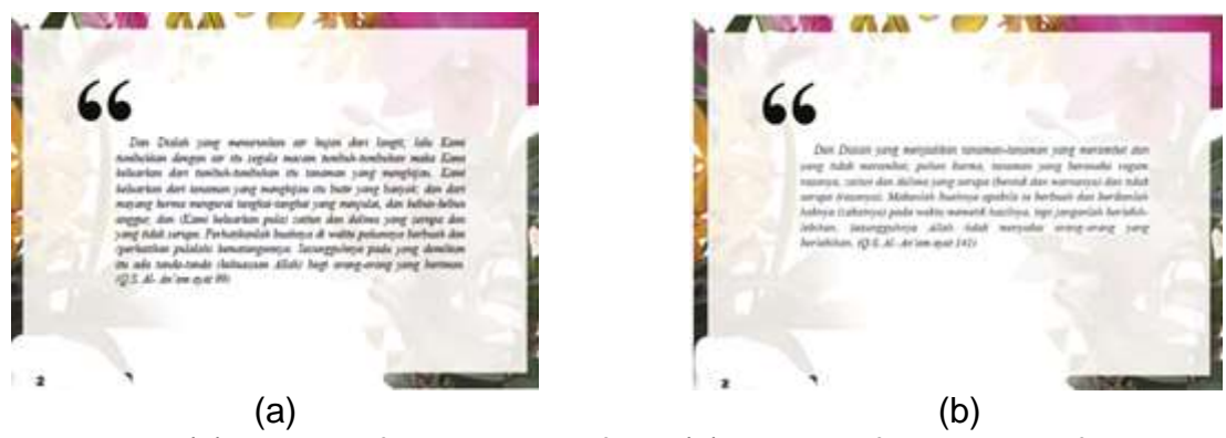
Figure 4. (a) Verses of the Koran before, (b) Verses of the Koran after revision

The verse of the Qur'an before the revision was QS AI-An'am verse 99, because according to the validator the verse was not in accordance with the discussion, after the revision it was changed to QS AI-An'am verse 141.