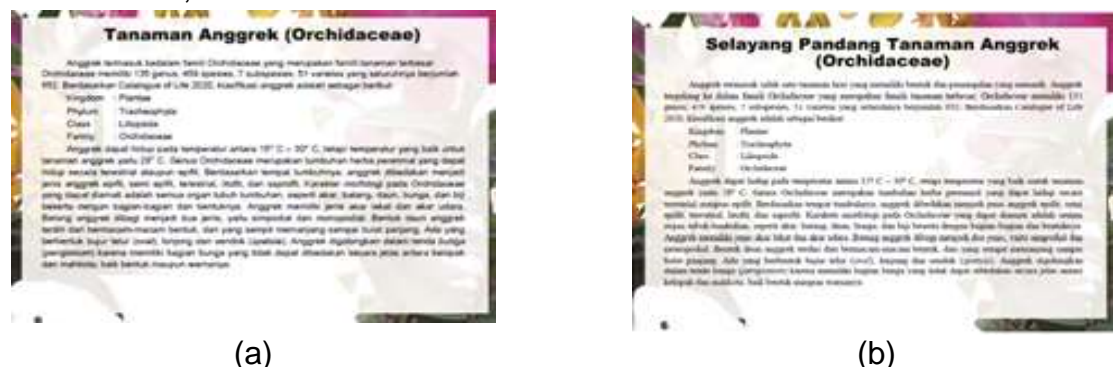
Figure 5. (a) Writing topics before revision, (b) Writing topics after revision

The sentence used for topic writing, before the revision was only the word "Orchid Plants (Orchidaceae)". After the revision, it was changed to "Orchidaceae at a Glance", to make it look more attractive.