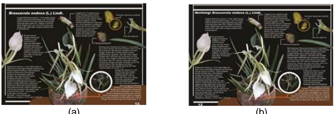
Figure 7. (a) Writing before revision, (b) Writing after revision