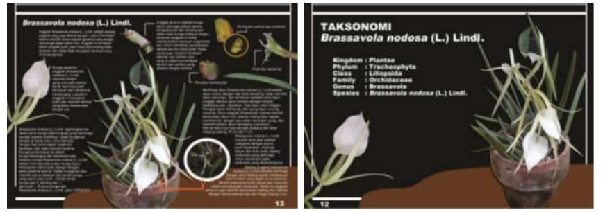
Figure 3. The contents of the encyclopedia book