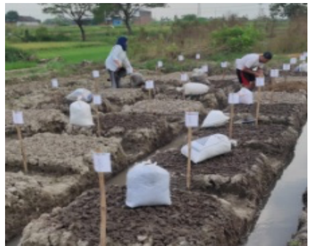
Figure 2. Bokashi addition is the first process to be done before planting shallot for the experiment.

Bokashi fertilizer (self-made from rice straws fermentation) was given once during land cultivation (2 weeks before planting) by mixing topsoil with fermented rice straw bokashi. Before being used, rice straw was fermented in anaerobic condition for one week