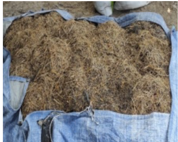
Figure 1. Bokashi fermentation processes in anaerobic condition for one week before being used as one of the treatments for this experimentation.

a length of 120 cm, a width of 120 cm and a height of 25 cm as many as 36 plots according to the research layout and the distance between the plots and between blocks measuring 50 cm respectively. The planting medium was not given basic fertilizer to determine the actual effect of the treatment.