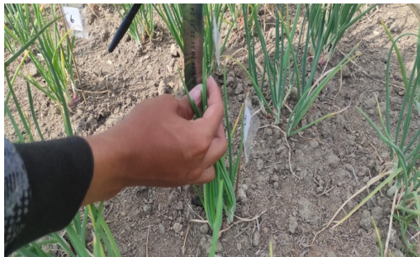
Figure 4. The measurement process during the research. Shallot height measured manually using a ruler once a week to study about the effect of bokashi and rabbit urine addition

The provision of rice straw bokashi was adjusted to the levels that had been made previously, namely 0 kg/plot, 3 kg/plot, 4 kg/plot and 5 kg/plot, each repeated 3 times.