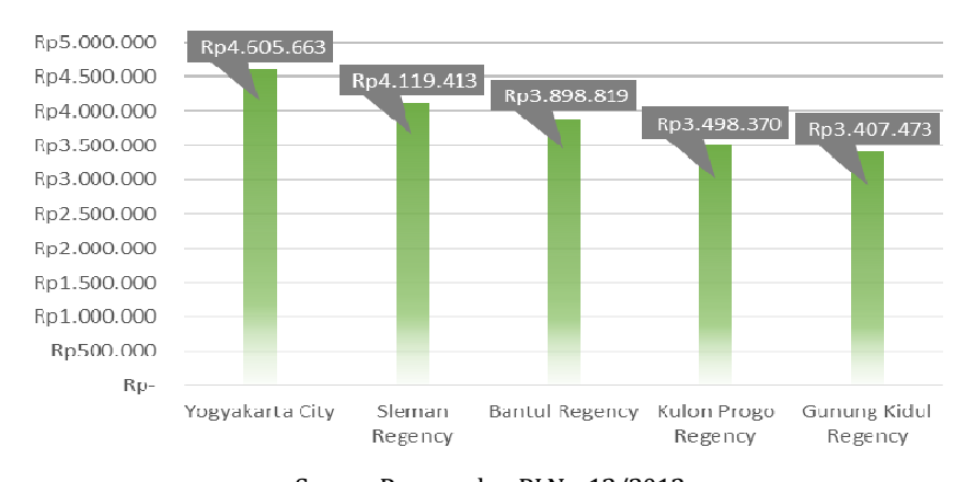
Figure 2 Decent-Life Necessities Yogyakarta 2023