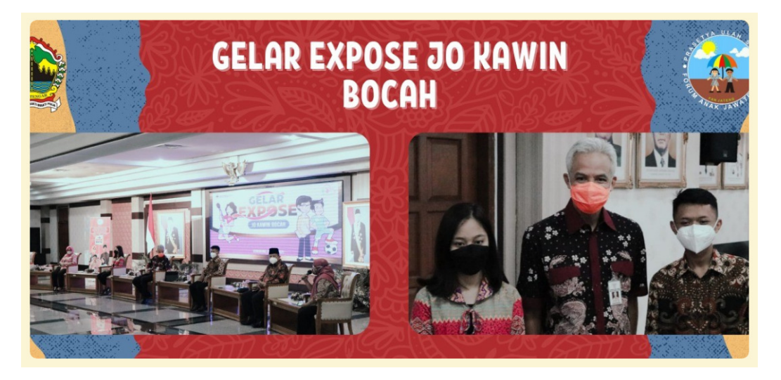
Figure 6 The " Jo Kawin Bocah " Expose, in the form of an interactive talk show.

JSW (Jurnal Sosiologi Walisongo) – Volume 7, No. 2 (2023)