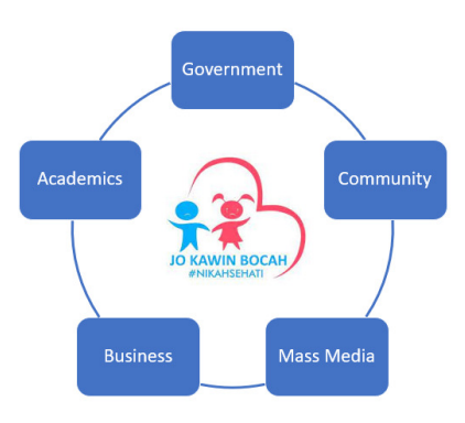
Figure 2 The Stakeholders Involved in the "Jo Kawin Bocah" Social Movement, adopted form the "Jo Kawin Bocah" pocketbook (DP3AP2KB Prov. Jawa Tengah 2021)