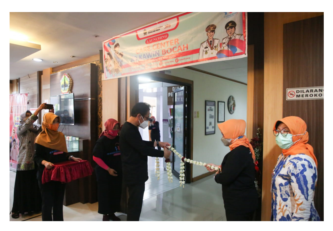
Figure 5 Launching of the "Jo Kawin Bocah" Care Centre - Central Java Province