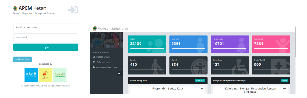
Figure 3 Screenshot of the "Apem Ketan" Application Website