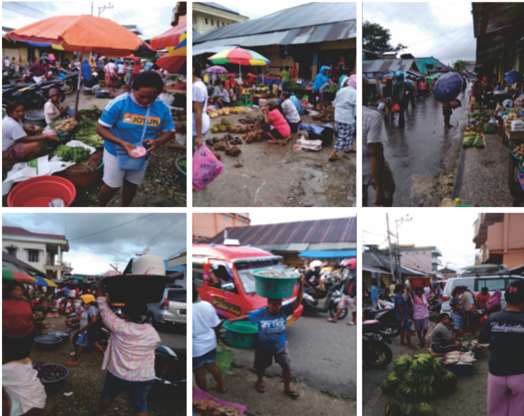
Figure2 Papalele Activities in Saparua Markets

markets can be by the coast or in the hinterland because villages occupy each area. The necessities of two community types (coast and hinterland) are accommodated by establishing a different market for each community. It signifies that one community gets one market type (or homogenous market), which is not enough because people are developing and need a higher level of necessities. Despite the difference between each island, people agree that the ideal market must be located at the coast because it allows merchants to arrive on the island or go out for other trading places, mainly Ambon.