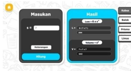
Figure 10. Calculator View

Figures 8 and 9 show the find the formula menu which is a menu that aims to help students find concepts in the flat-sided wake-up material by finding their own formulas with questions and statements of assistance provided.