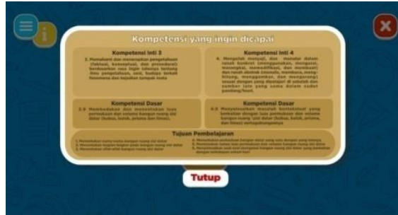
Figure 5. Display of KI, KD, and Learning Objectives

Figure 4 shows the display of the media instructions containing the sound settings menu, developer profile and criticism suggestions menu. The KI KD menu contains KI, KD, and learning objectives on the flat-sided building material.