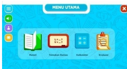
Figure 6. Material Menu Display

Figure 5 describes the main display on the learning media containing material, find formulas, calculators, and evaluations, as well as the menu for voice settings instructions, developer profiles, and criticism suggestions.