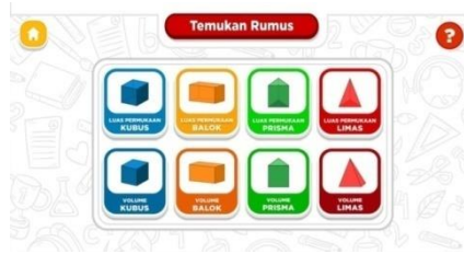
Figure 8. Menu Display Find Formulas