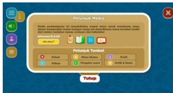
Figure 4. Media Hint Display

Figure 3. shows the instructions menu button located in the upper left corner of the opening menu, will open an instruction menu containing the KI KD menu, media usage instructions menu, sound settings menu, developer profile menu, and criticism suggestions menu.