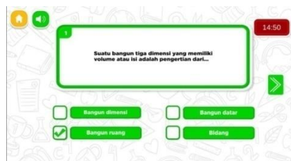
Figure 11. Evaluation Menu Display

Figure 10 shows the calculator menu used to calculate the volume and surface area, according to the selected submaterial.