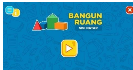
Figure 3. Opening View

Figure 2 shows the initial display when the user opens the application, namely the appearance of the Ahmad Dahlan University logo. After that, the user will see an opening menu display that contains the name of the learning media as well as an image of the flat side shape, a menu of instructions, and a button that directs the user to the main menu.