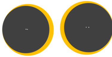
Figure 2. Illustration of the beginning (left) and the end (right) of a total or annular eclipse.

While the beginning of a partial eclipse (contact 1) and the beginning of a partial eclipse (contact 4, last contact) occur when the absolute value of the difference between the ecliptic longitude of the Sun and Moon is equal to 31' 31''.52 (see Figure 1 right and left), is the sum of the average values of the Sun's semi-diameter ( 15' 59''.63 ) and the average semi-diameter of the Moon ( 15' 32''.58 ) 27 , then to predict the beginning of the total eclipse (contact 2) and end total eclipse (contact 3) can be determined by comparing the ecliptic longitude difference of the Sun and Moon with the value 0^\circ 0' 27''.05 = 0.007513889^\circ = 27.05 arc seconds. This value is the result of the difference between the average value of semi- the diameter of the Sun and the average semi-diameter of the Moon, the sum and the difference between the semi-diameter of the Sun and the Moon can also be determined on the fly with the Sephem program (Simple Ephemeris Program) so that the realtime value matches the semi-diameter values of the Sun and Moon when the process of accounting Sun eclipse.