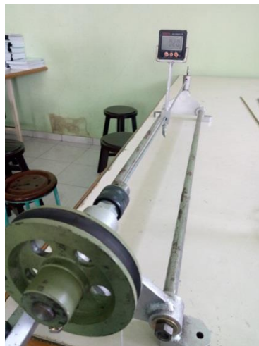
Figure 3. The Torsional Modulus Experiment Tool

The working principle of this torsional modulus experiment is when the rope is given a mass of load ( m ), the twisting wheel will move to twist the metal rod with a certain angle of deviation ( \alpha ) at each distance of the twisting point from the metal clamp.