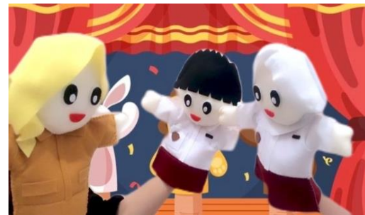
Figure 3. Digital Storytelling-based Hand Puppets

Utilize Media and Materials , by utilizing technology to develop hand puppet media into digital storytelling, before students practice hand puppet media, students are asked to see digital storytelling shows as shadows so that students better understand and begin to imagine.