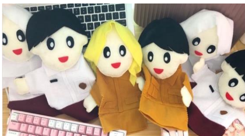
Figure 2. Hand Puppets

Select Media and Materials , by finding and selecting media, methods, and materials so that the utilization of hand puppet media can run effectively and making storyboards so that the series in the product and the material to be given to students can be arranged systematically.