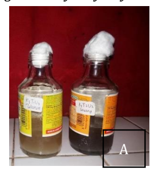
Figure 1. Color changes in the media exhibited by the bacterial isolates at 28°C after 14 days of incubation (A: High-Density Polyethylene Plastic; B: Low-Density Polyethylene Plastic)

The screening test conducted on liquid media generated positive results for all 19 bacterial isolates. It indicates that the media, which contained High-Density Polyethylene (HDPE) and Low-Density Polyethylene (LDPE) plastics, underwent noticeable color changes and became hazy. The clear medium transformed into dark green, brown, and yellow, as evidenced by the observed color change. Figure 1 visually presents the alterations in the media's color.