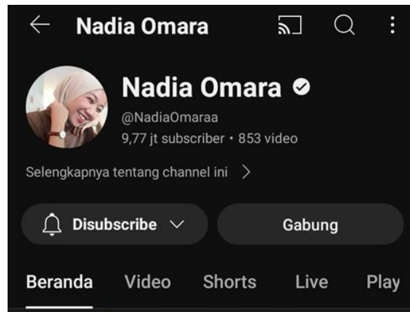
Figure 1. Number of Nadia Omara's subscribers

and positive audience responses also demonstrate Nadia Omara's success in designing content that is able to foster audience interest and engagement (Trie et al., 2024).