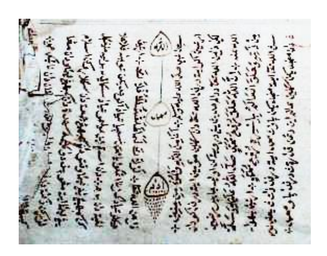
Figure 1 The relation between Allah, Muhammad, and Adam Photographed by Faizal Amin, 2 Mei 2019, Putussibau

Furthermore, MS AAT 01 and MS AAT 05 display pictures (Figure 1) showing the relationship between Allah-Muḥammad-Adam.