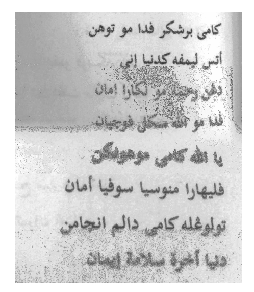
Figure 8. The Eighth Poem