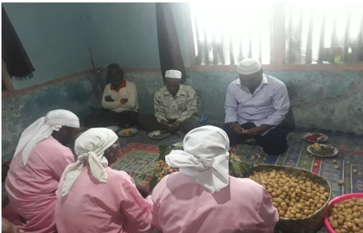
Figure 5 Customary leaders Taste Langsat Fruit Together (Private Document, 2019)