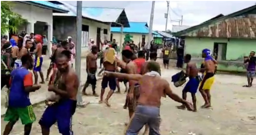
Figure 7 Throwing Langsat fruits between Gamta and Magey villages (Private Document, 2019)

custom which is arranged in a customary structure in the two villages with different religions. This tradition is an event that is still carried out by Magey and Gamta villagers every year, and has legal rights in the Matbat in order to regulate kinship between the two villages with the different religions.