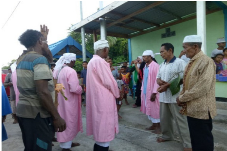
Figure 2 Indigenous elders in special clothes (Private Document, 2019)

At the fruit inspection stage used in the Som tradition, not everyone can check the fruit. Saukisi from Magey village can only do it through Joiau's approval in Gamta. All people must obey this provision in the two villages. The leaders' identity plays an important role in ownership or belonging, differentiating them from other people in the Matbat to carry out the Som tradition in the examination stage.