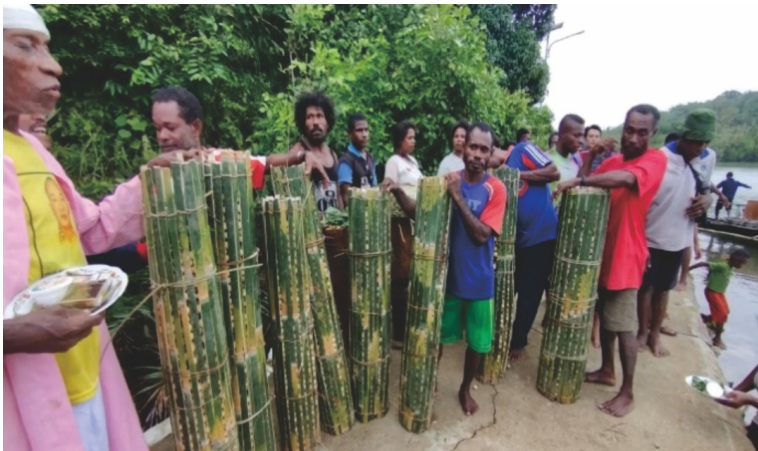
Figure 3 Langsat fruit ( Lukum ) which is in the face (Private Document, 2019)

special place called Kaponi . These four objects are the habits of the local people that cannot be separated from their daily consumption, this is the same as the Papuan people in general. which is when they have guests, either from outside the area or within their environment. Meanwhile, Kaponi is a place to put the four objects. Kaponi is a kind of place like a basin but made of woven forest ropes. Then, a place is prepared to put the fruit of the harvest that will be brought. This special place is called Tatap . Sugar tea is also not forgotten which has become a habit of the villagers when guests arrive. The six customary leaders - Jojau, Major, Hokum, Saukisi, Samayanim and Saruan- must wear their respective customary clothes. One of Jojau's traditional clothing characteristics is a robe which is bearing the symbol of a bird of paradise (Abdullah Sani Wihel, personal communication, 2019).