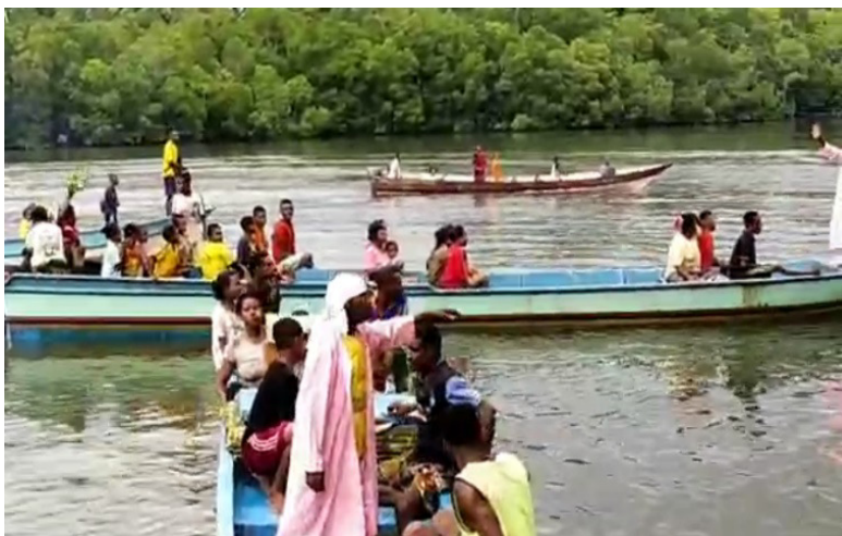
Figure 4 Arrival of the Magey community by boat to Gamta village (Private Document, 2019)

crops. The meaning of these songs is their close cooperative/bilateral relation that others cannot separate. They would have played traditional games, namely, throwing fruit at each other. The game would have started when the customary leader of Magey village throws fruit at the house of the indigenous people of Gamta village. That is the time when the fruit throwing process is carried out (Abdullah Sani Wihel, personal communication, 2019).