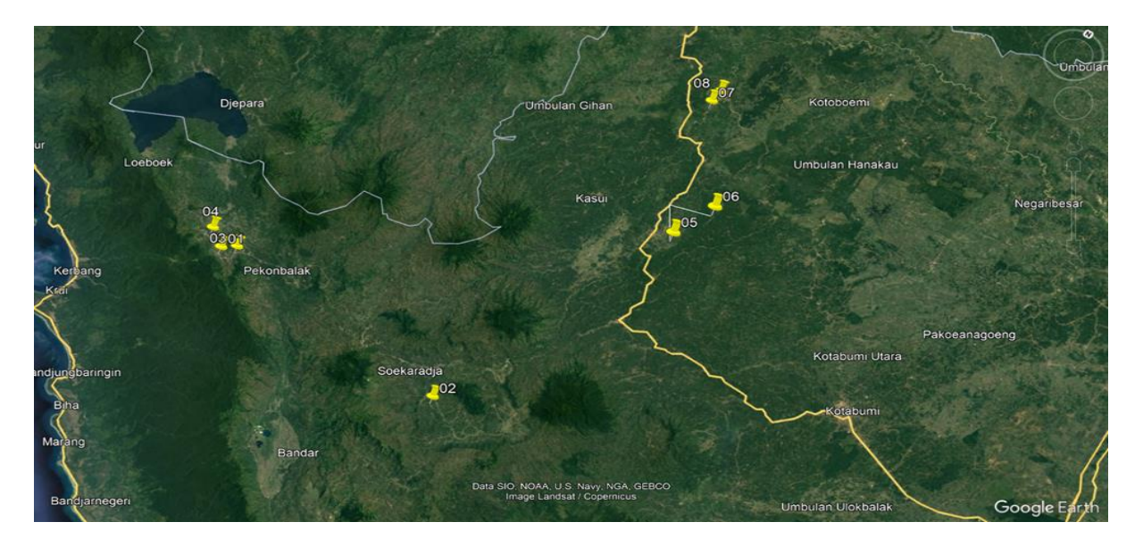
Figure 1. Monitoring Points in Lampung Barat and Way Kanan Regencies

Regency is included in the safe and harmless category. The effect on human health, aesthetic appeal, and other living things determines the value of the Pollutant Standard Index (PSI). It applies to all types of locations, describing the state of ambient air quality at the sampling location (Gusti, 2019).