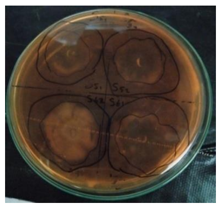
Figure 1. Bacterial colonies growing on CMC media

Characteristic of bacterial isolates can be seen based on the morphology formed. There was a variety of all bacterial morphology. It can be seen in Table 1.